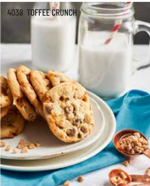
4038 TOFFEE CRUNCH