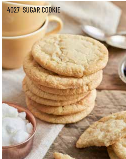
4027 SUGAR COOKIE