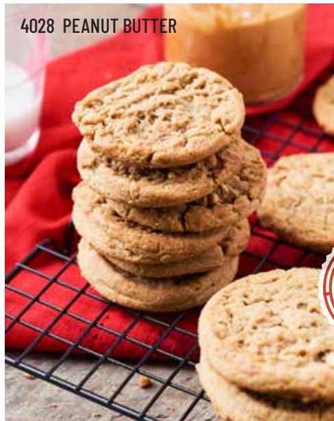
4028 PEANUT BUTTER