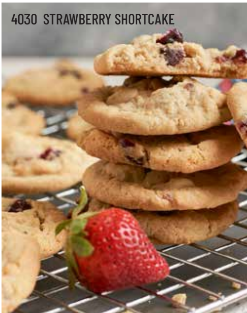
4030 STRAWBERRY SHORTCAKE