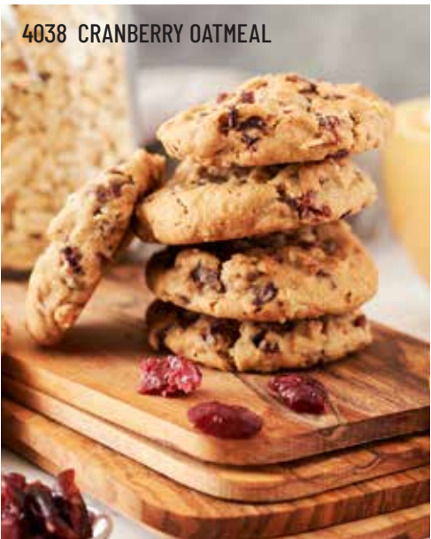
4038 CRANBERRY OATMEAL