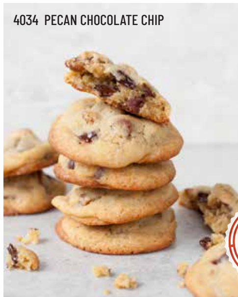
4034 PECAN CHOCOLATE CHIP