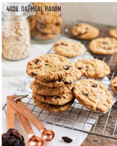
4026 OATMEAL RAISIN