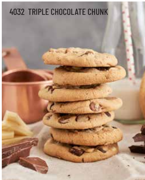
4032 TRIPLE CHOCOLATE CHUNK