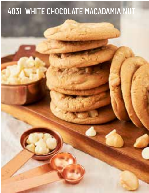
4031 WHITE CHOCOLATE MACADAMIA NUT