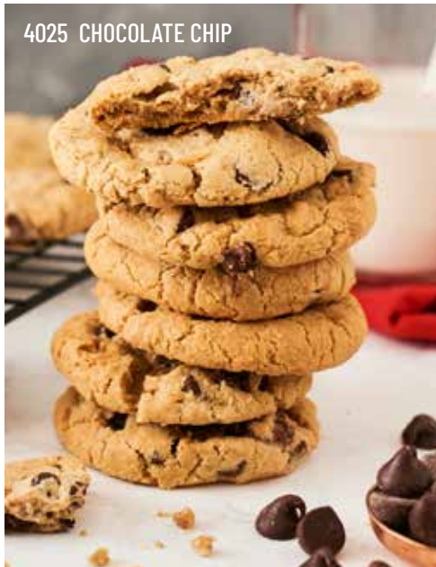
4025 CHOCOLATE CHIP