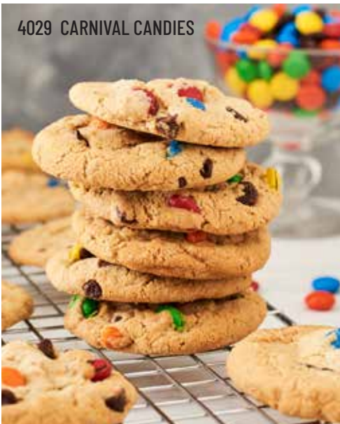
4029 CARNIVAL CANDIES