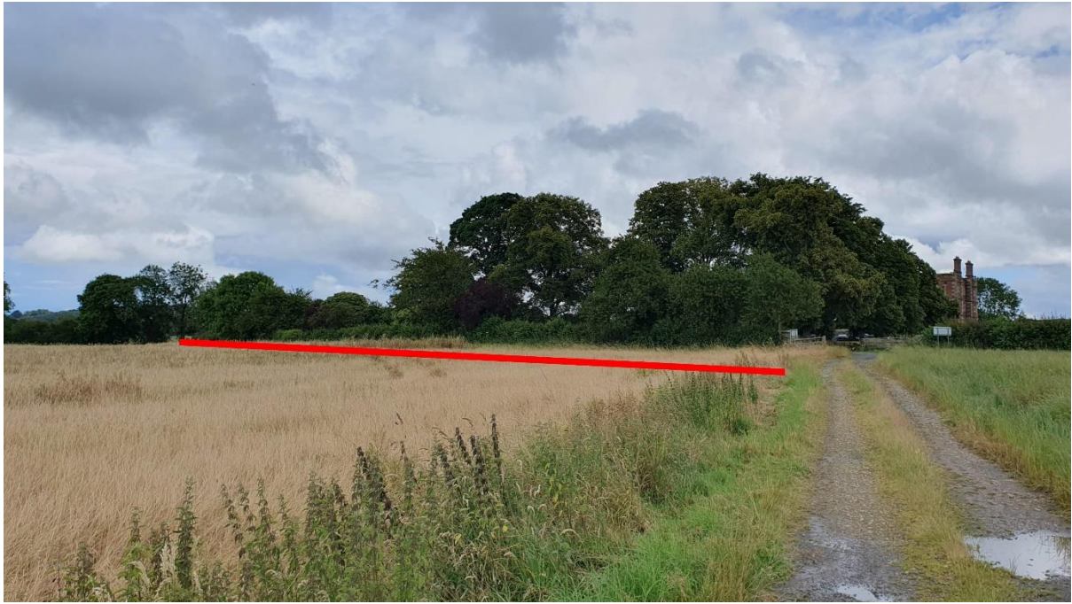
Red line indicates boundary of proposed Pocket Park (view from track to Soulton Long Barrow, southwards).