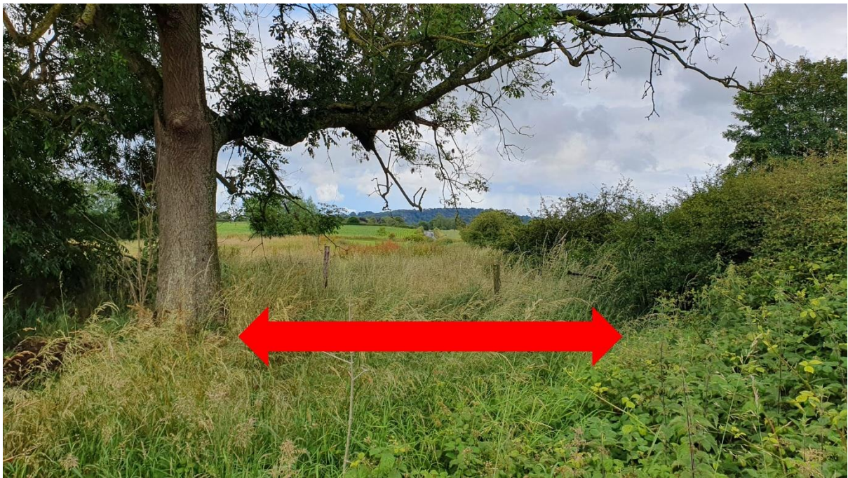
View from proposed Pocket Park into SAM area (Soulton Castle). Red arrow indicates aperture through boundary for access, currently blocked by a barbed wire fence.