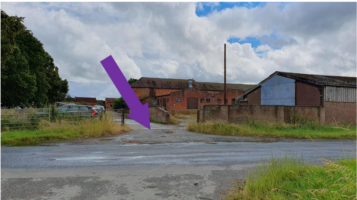
Current bus stop westbound.