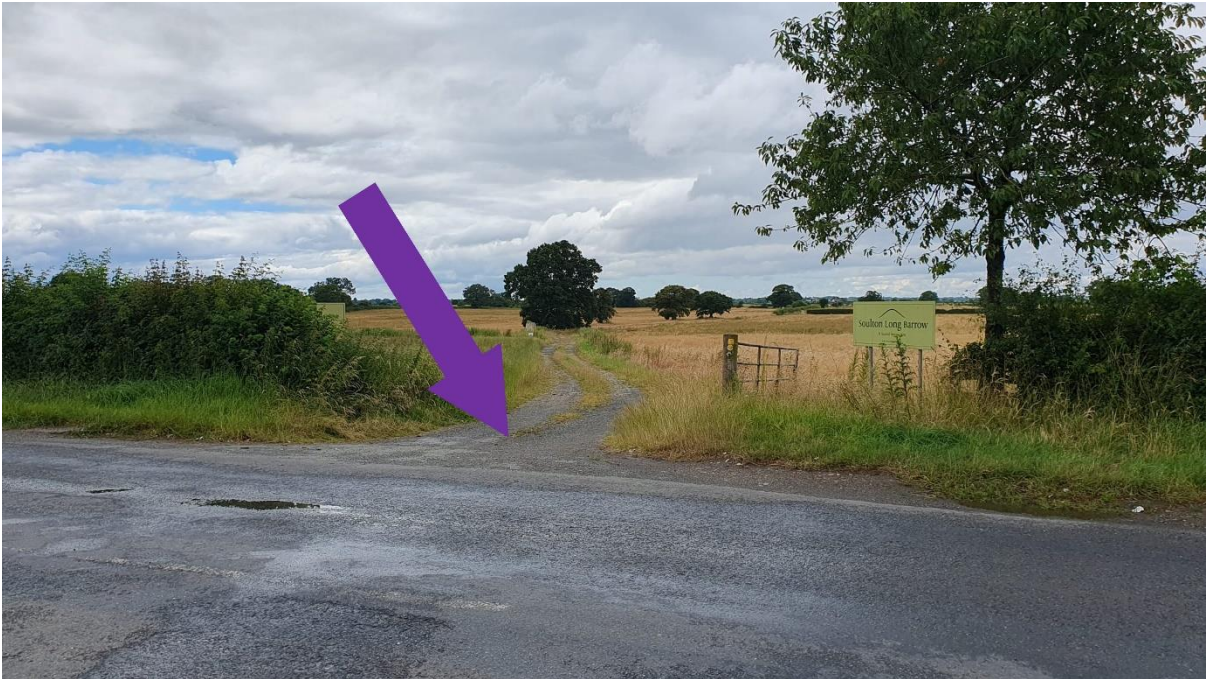
Current bus stop eastbound.