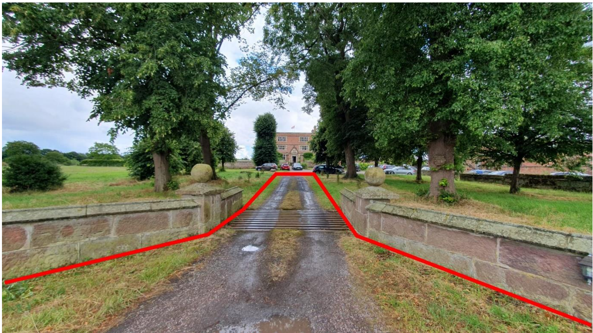
Red encloses proposed pedestrian area.