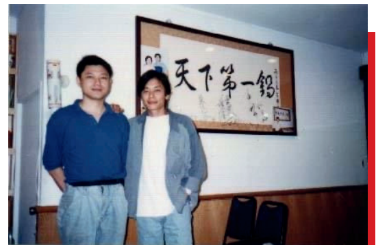
The owner and a Hong Kong actor, Nicholas Tse