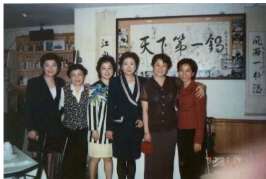
Taiwanese celebrities dining at the restaurant