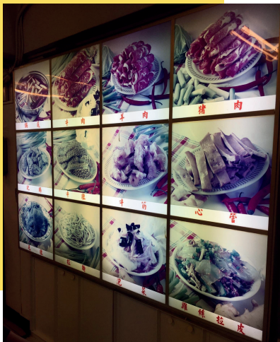
First restaurant menu in 1973

Since introducing our CPGs to the market in 2000, Ning Chi has continued to grow and thrive, with no plans of slowing down. Though we've come a long way from our humble beginnings, our dedication remains unwavering. Our mission is to deliver the highest quality by using the freshest local ingredients to craft unique flavors that evoke nostalgic memories with every bite.