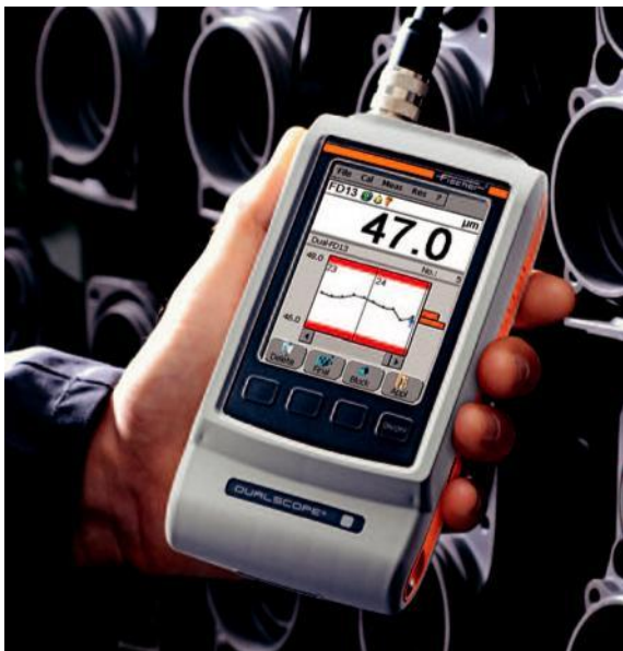
Graphical display of the measurements with the set specification limits. The histogram of the measurements is additionally shown on the right display site