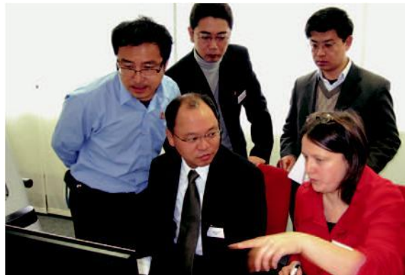
A FISCHER seminar teaches metrological basics and practical knowledge in small groups

Because we want you to receive maximum benefit from our products, FISCHER's experts are happy to share their application know-how. The seminars not only teach metrological basics but also hand-on experience in small groups to put the theory into practice.