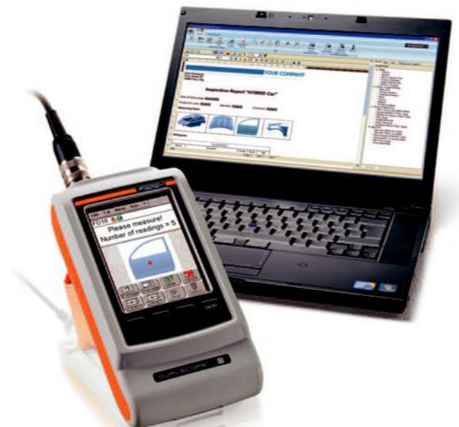
The inspection plan, created on a PC, is loaded up onto the instrument. The instrument shows the measurement spots directly on the specimen and the number of the required measurements