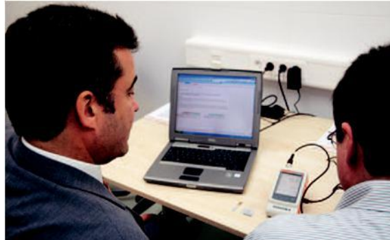
User training for the DUALSCOPE® FMP100 on-site at the customer's

With our training program we make your employees fit on-site for your measuring task. Our trainer takes account of your individual requirements and wishes.