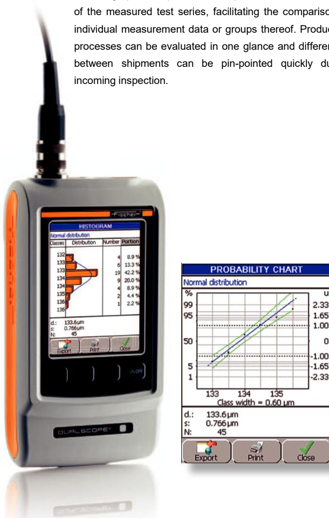
Typical examples of evaluation options, as viewed on the high-resolution colour displays of the DUALSCOPE FMP100

Evaluation options available for the DUALSCOPE FMP100 instrument include block and final results, histo-gram, sum frequency, FDD (Factory Diagnosis Diagram) and matrix evaluation. This allows the measured values to be evaluated according to the user's requirements. The various graphical representations provide a clear overview of the measured test series, facilitating the comparison of individual measurement data or groups thereof. Production processes can be evaluated in one glance and differences between shipments can be pin-pointed quickly during incoming inspection.