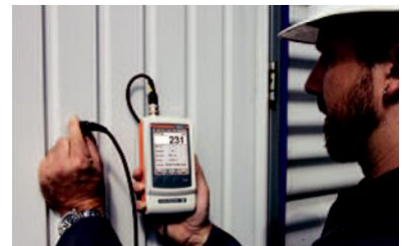
Measurement of paint coating thickness

The DUALSCOPE FMP100 uses both the magnetic induction method (DIN EN ISO 2178) and the eddy current method (DIN EN ISO 2360). It can measure the following coating/substrate systems: