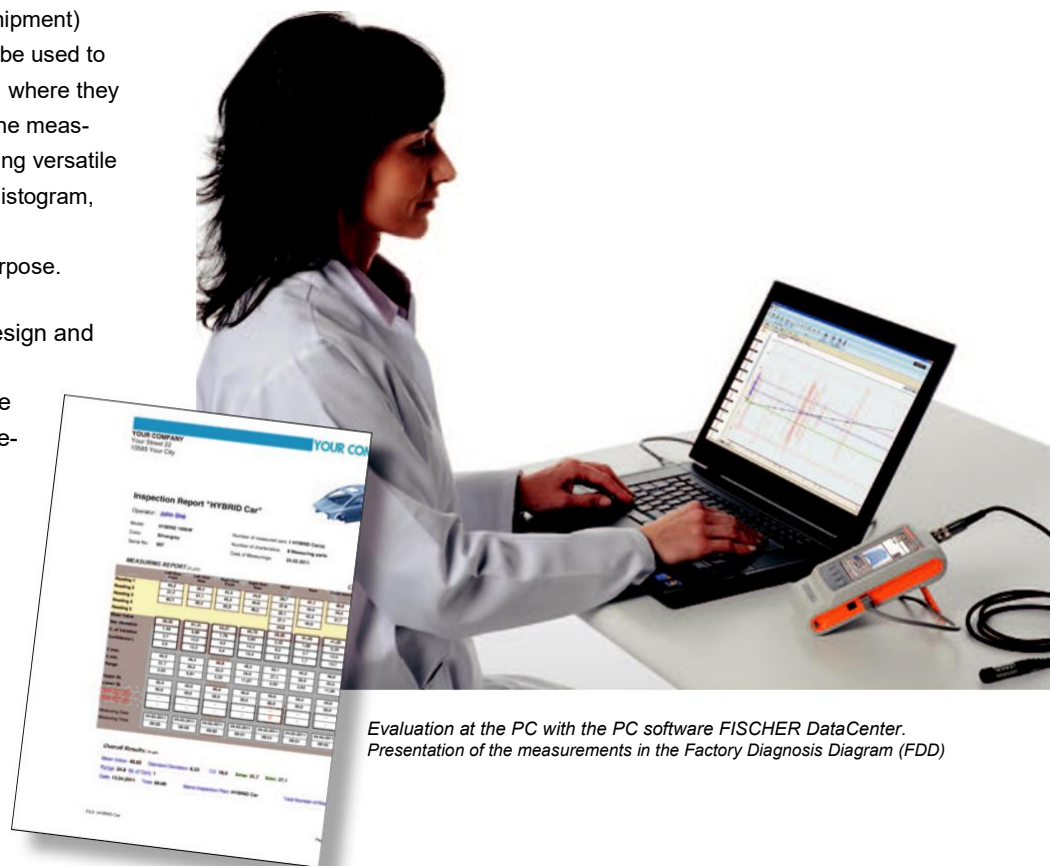
Evaluation at the PC with the PC software FISCHER DataCenter. Presentation of the measurements in the Factory Diagnosis Diagram (FDD)

The DataCenter software allows for the design and creation of individual reports using one's own logos, images and graphics. Using the drag and drop function, it is possible to integrate measurement data, statistical data and graphs, as well as to create report templates based on scanned forms.