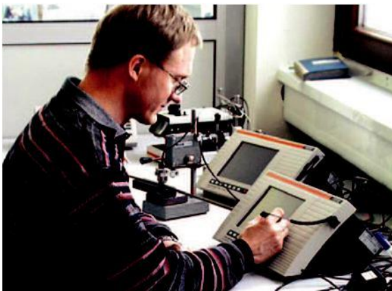
Measuring on a customer's specimen in a FISCHER application laboratory

More and more, demanding applications require highly qualified application advice. FISCHER addresses this need with its application laboratories located around the world (Germany, Switzerland, China, USA, India, Japan and Singapore).