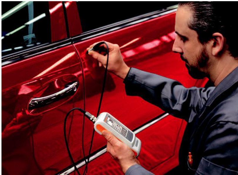
Measurement of auto body paint thickness using the dual probe FD13H

With the optionally available inspection plan management software, FISCHER DataCenter IP, this professional measurement instrument turns into multi-functional data terminal, opening up a whole new dimension in metrology. With the help of visually-aided operator guidance, individual inspection plans created on a PC can be executed step-by-step on the instrument – and the results evaluated conveniently at the PC.