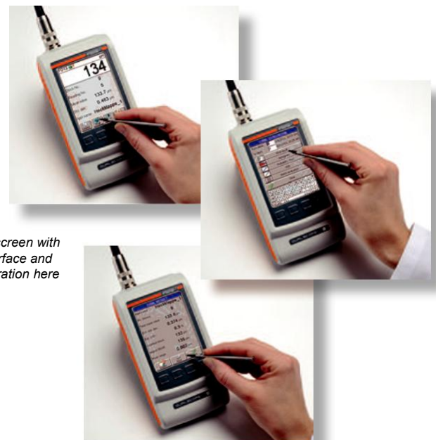
Graphic display screen with menu-driven interface and touchscreen operation here with a stylus