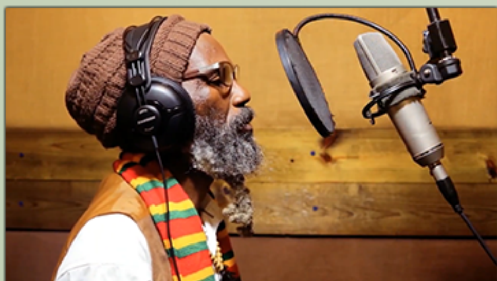
FIRE IN THE HOUSE FT. ANTHONY B