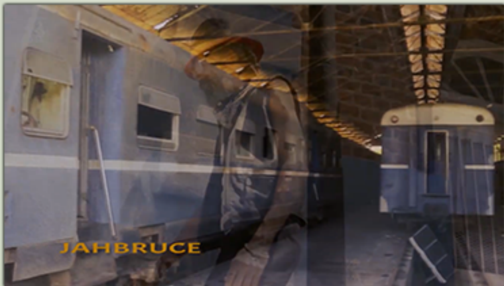
RAILWAY STATION PT. 1