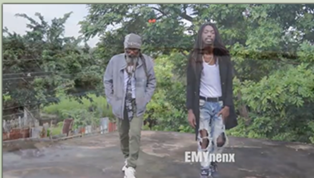
SAVE ME FT. EMYnenx