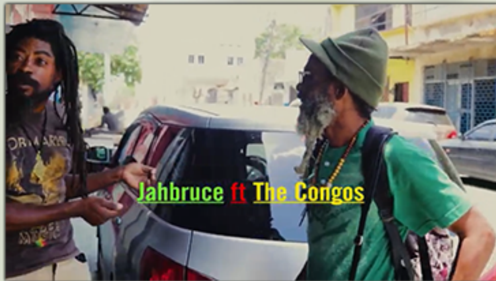
ONE MORE RIVER FT. THE CONGOS