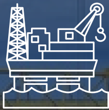
Offshore Oil & Gas and Renewable Energy