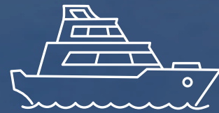
Luxury Maritime & Yachting Industry