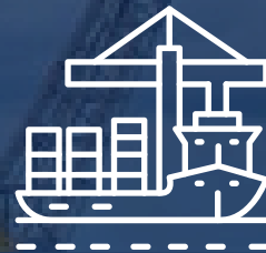
Ports, Harbors, and Marine Terminals