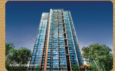
88 EAST — ALIPORE —