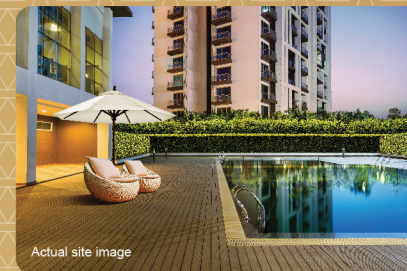
PRIMANTI VILLAS AND RESIDENCES — GURUGRAM —