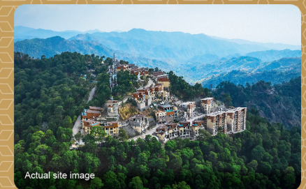
MYST ECO-LUXURY RESIDENCES — KASALI —