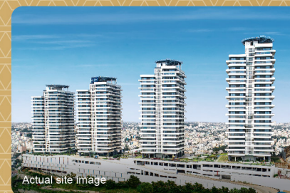
THE PROMONT — BENGALURU —