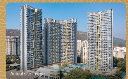
SEREIN — THANE (W) —