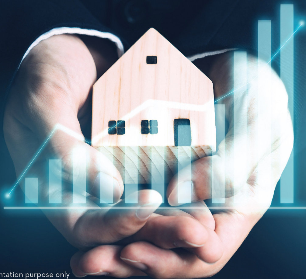
Image for representation purpose only