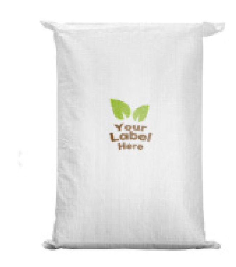
50 kg / 110 lb