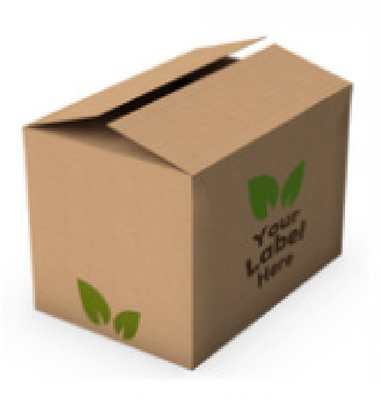
20 kg / 44 lb