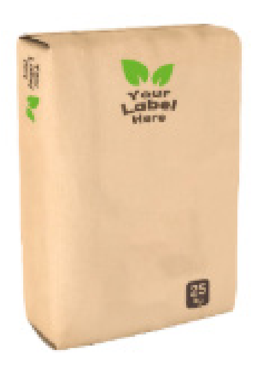
25 kg / 55 lb