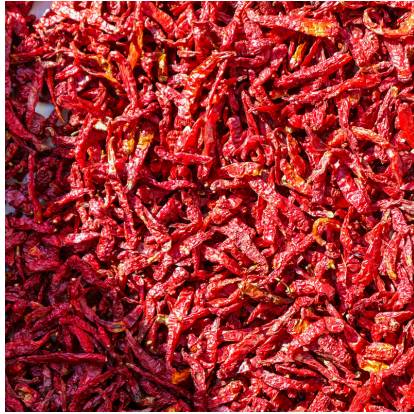
RED CHILLI (SH-201)

Red Chilli - HS Code: 09042110 from India is renowned for its deep red color, rich aroma, and balanced heat. Widely used in global cuisines, it is a key export spice valued for flavor, pungency, and natural coloring properties. Most popularly grown in Guntur Regions.