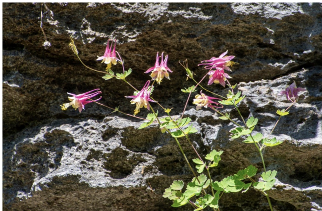
Wild columbine, Aquilegia canadensis at Lost City Canyon, Candler Park.