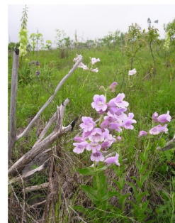
Journal of the Oklahoma Native Plant Society Volume 23, August 2025

All archived issues of the Oklahoma Native Plant Record are available online at: