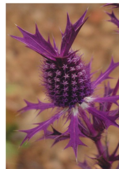
Journal of the Oklahoma Native Plant Society Volume 21, December 2021

All archived issues of the Oklahoma Native Plant Record are available online at: