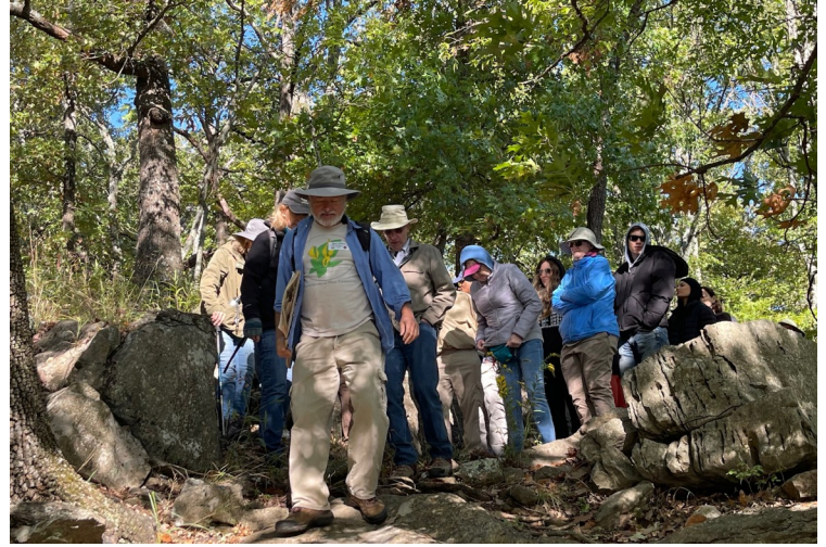
Participants at Annual Meeting.

previous edition of the Gaillardia were approved by those present.