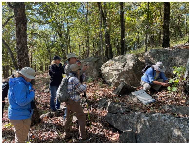
ONPS members at 2023 ONPS Annual Meeting.