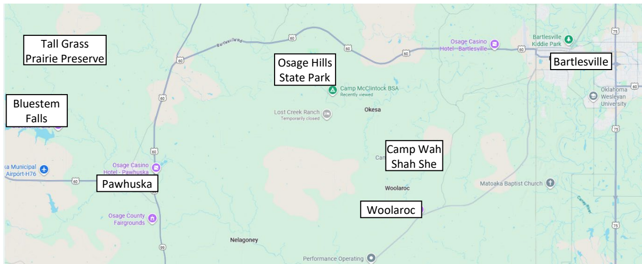
Google map screen capture of area

Nearby places of interest are Bartlesville to the northeast, Woolaroc to the southwest, Osage Hills State Park to the northwest, and farther is Pawhuska, or Bluestem Falls to the west, and the Tallgrass Prairie Preserve to the northwest (see map).