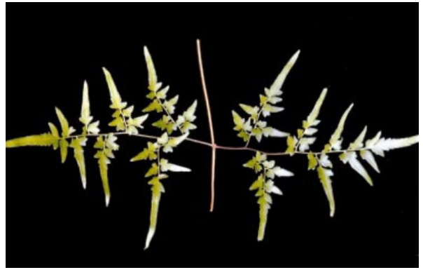
Langeland/Burks book, Identification & Biology of Non-Native Plants in Florida's Natural Areas