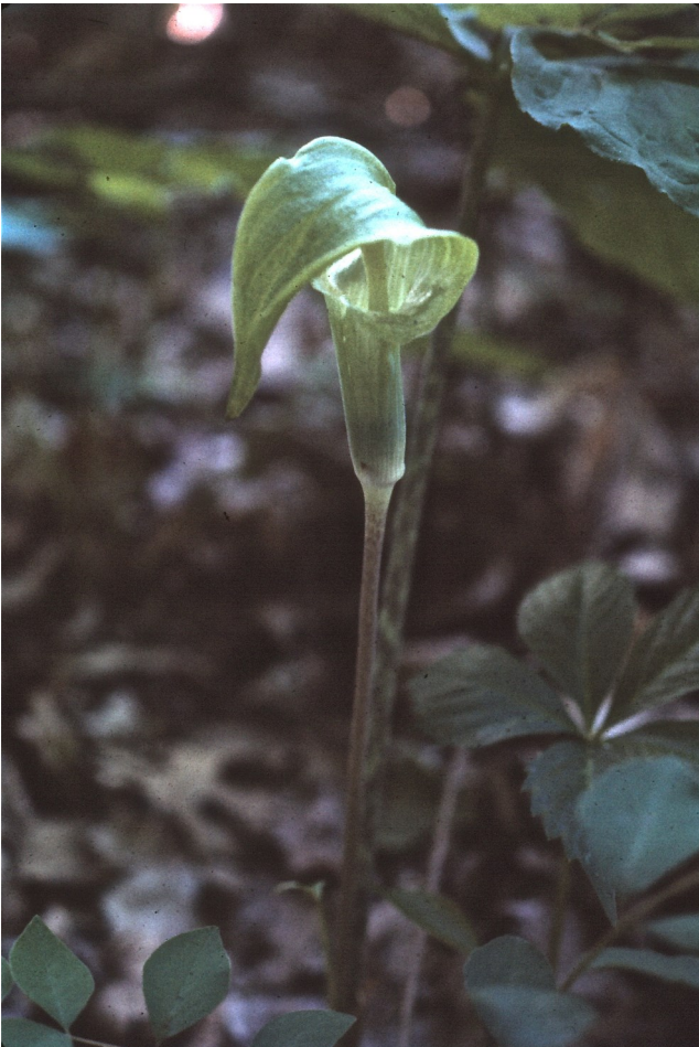
Close-up 3rd Place Jack-in-the-Pulpit