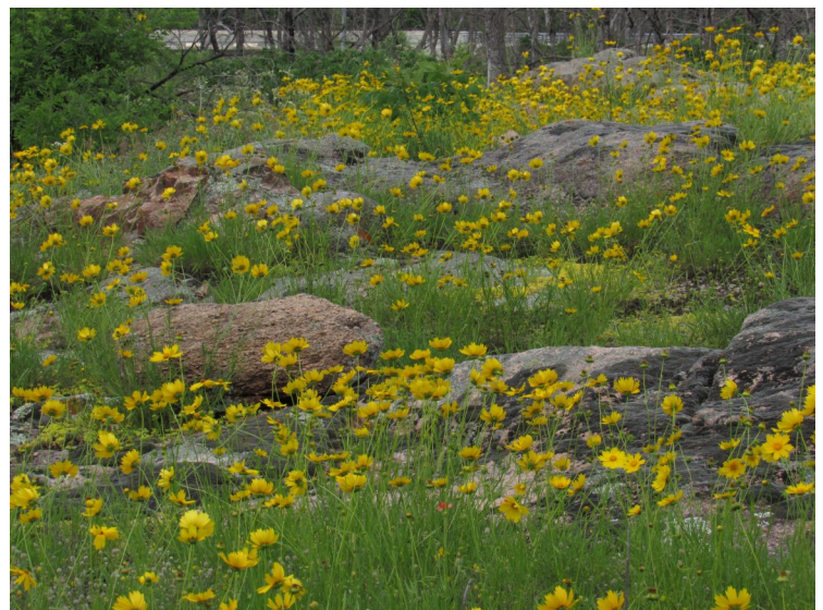
3rd place winner in Habitat

Note: all members are invited to all meetings, including board meetings, and are encouraged to bring guests