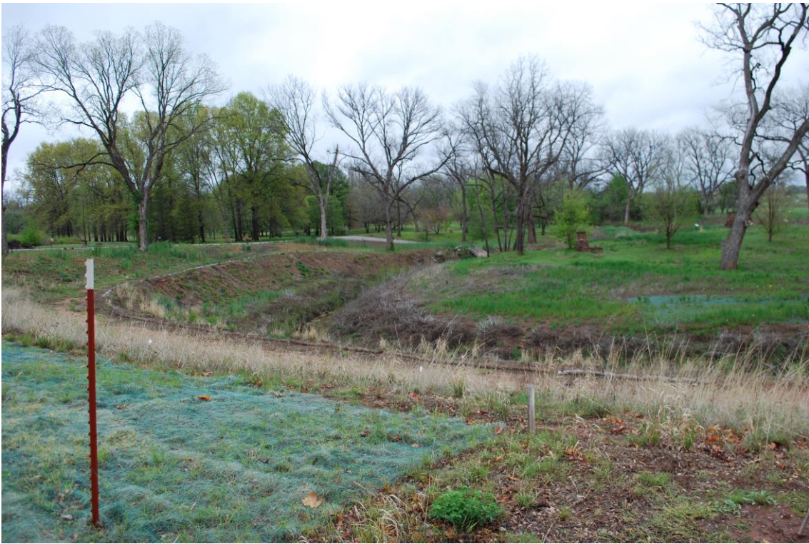
Cow Creek Restoration Area