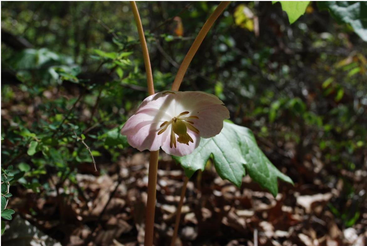
May Apple at Pontotoc Ridge Field Trip (Page 7)