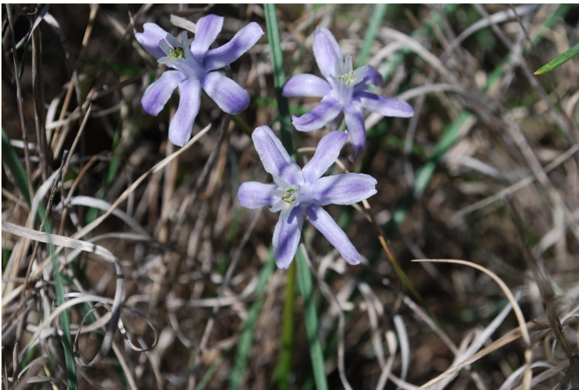
Blue Funnel Flower