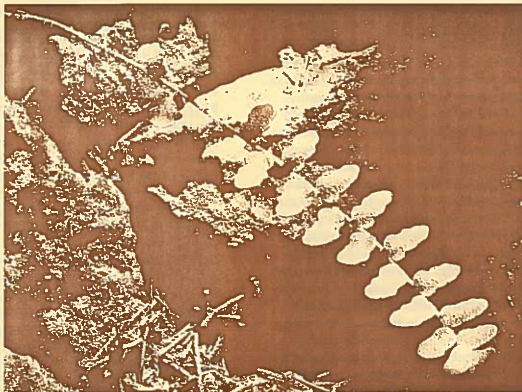
Astrolepis integerrima . Another favorite but difficult to find.

Now that you know a few things about the maidenhairs, it is time to go and see them. I would suggest that you try to find a field guide to ferns before you go on that first fern foray. If you cannot find one, do not hesitate to ask me for electronic photos. I have pictures of most members of the family. One of the best places to see them is in our state parks and state park resorts. I have listed nine species from four of the six genera in the family in the table below. These are the parks where I have found them. In order to see some of the more rare species it would require a field trip off the "beaten path". Let me know if you are interested in taking a field trip to see them. We might be able to arrange a trip together. Good luck and don't forget to your take camera.