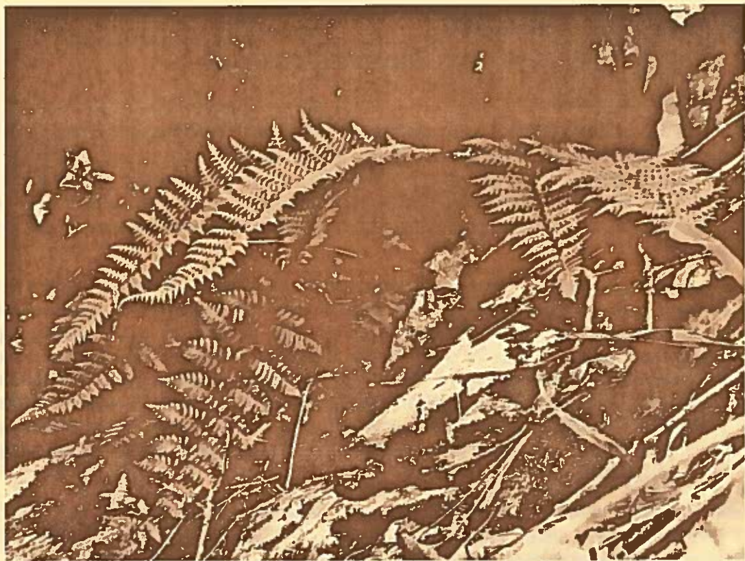
Cheilanthes alabamensis , the Alabama Lip Fern