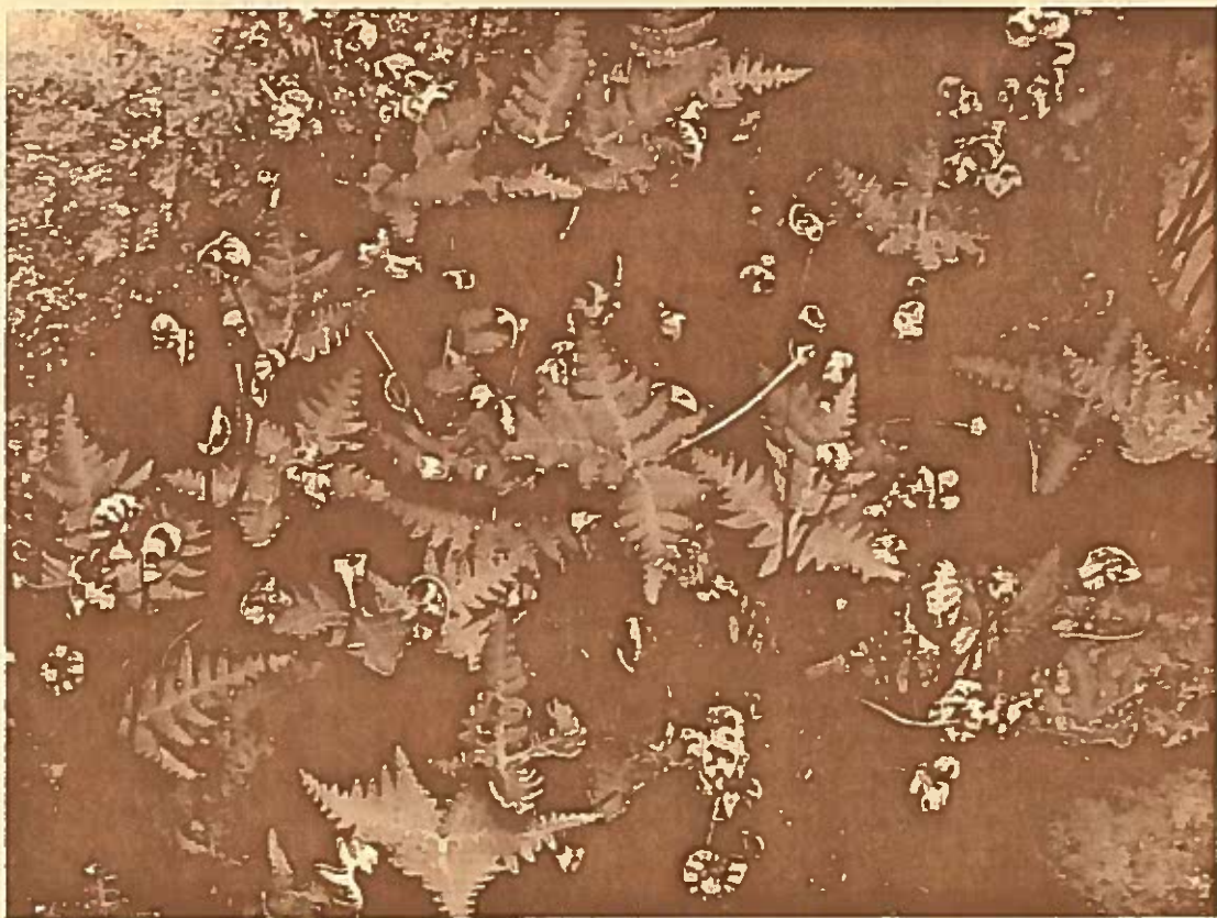
Notholaena standleyi A very unique maidenhair with a white to cream abaxial surfaces and a blade that has a star-like outline.