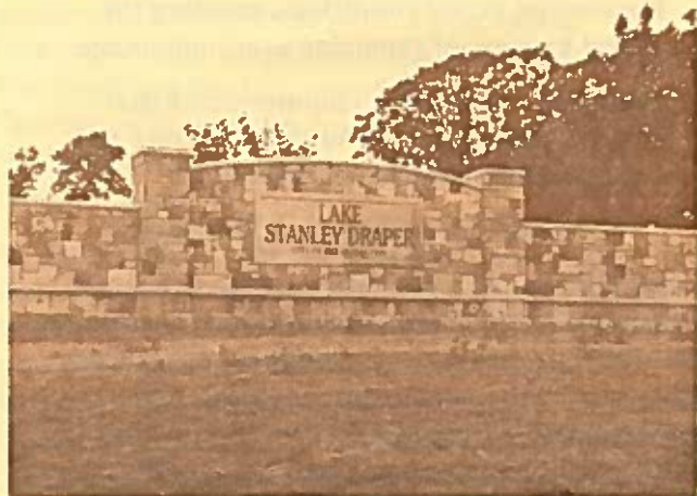
New Gate on Douglas South of I240