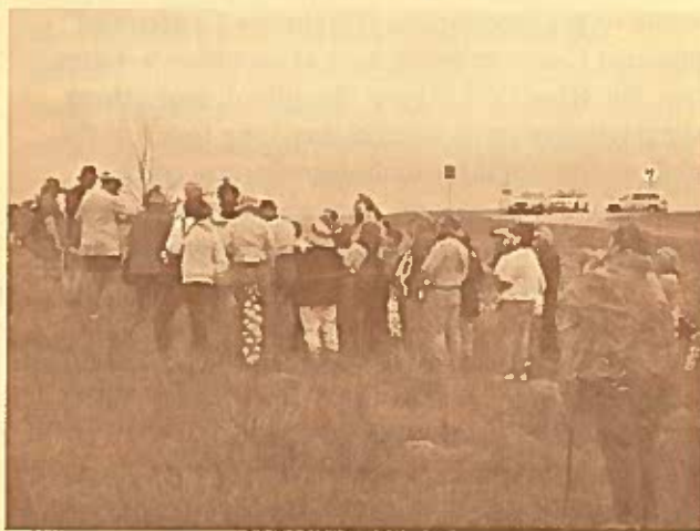
On the Sunday morning field trip