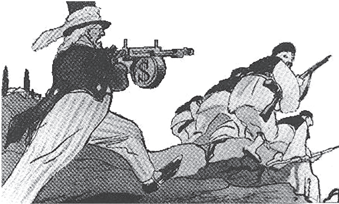
A cartoon published in the Soviet Union in 1947. It shows American aid during the Greek civil war.