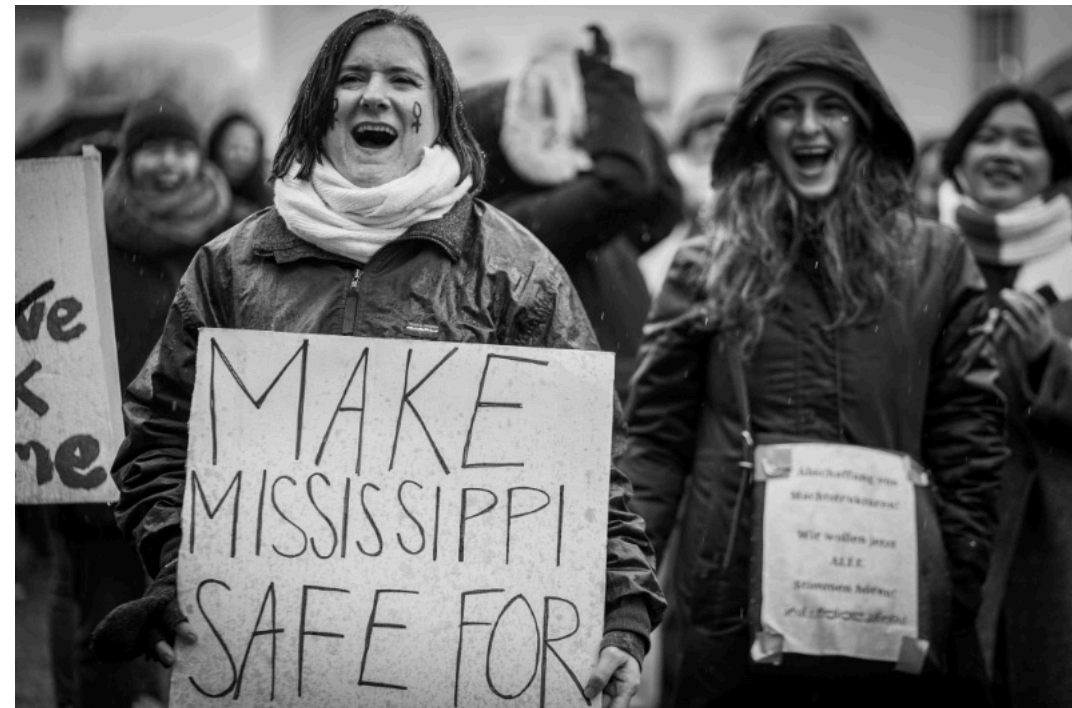
8.3.2023 | Screaming for USA, Georgia, Poland...