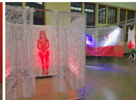
Botschaft der Polinnen*, exhibition, Women's Congress Hala Berga, Wrocław, 2022