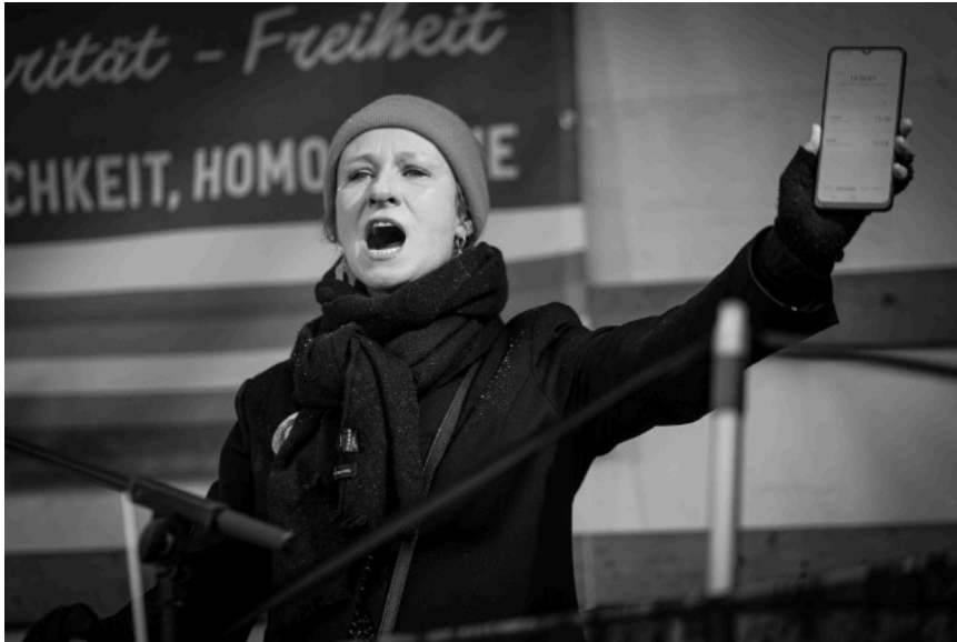
8.3.2023 | International Women's Day

I initiated #GlobalScream as a symbolic yet real action of women's solidarity beyond borders, in which every person can participate, regardless of ideological differences, nationality, language, religion or gender. Global Scream was also an attempt to unite the divided feminist community in Berlin on International Women's Day. At least for one minute. Thanks to this symbolic action held at the same hour, the participants of both marches were able to do something together although they were in different places – they screamed for a minute, together, although separately, and each for personal reasons. Global Scream is a woman's scream of rage, anger, grief and maybe even joy – each of us knows these emotions, even if the reasons are different. And each of us can scream. We don't even have to speak the same language to become one voice. The voice of women. Screaming becomes a kind of catharsis that releases emotions. Physically, screaming turns our negative emotions into positive ones, and oxygen releases power and energy to keep fighting. It is only a minute for a woman, but a global scream for the women of the world!