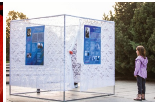
Irena Bobowska, exhibition Volkspark Friedrichshain, 13.9.2022