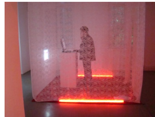
"Polish Wife", HackFemEast exhibition, Kunstraum Kreuzberg, 2008

Official opening of the Botschaft was on 22nd June 2020, at the Haus der Statistik, Berlin.