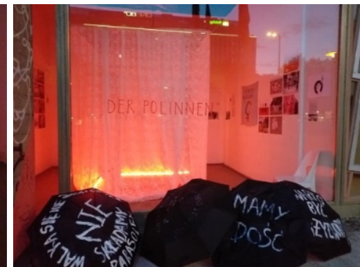
Botschaft der Polinnen*, opening Haus der Statistik, 22.6.2020