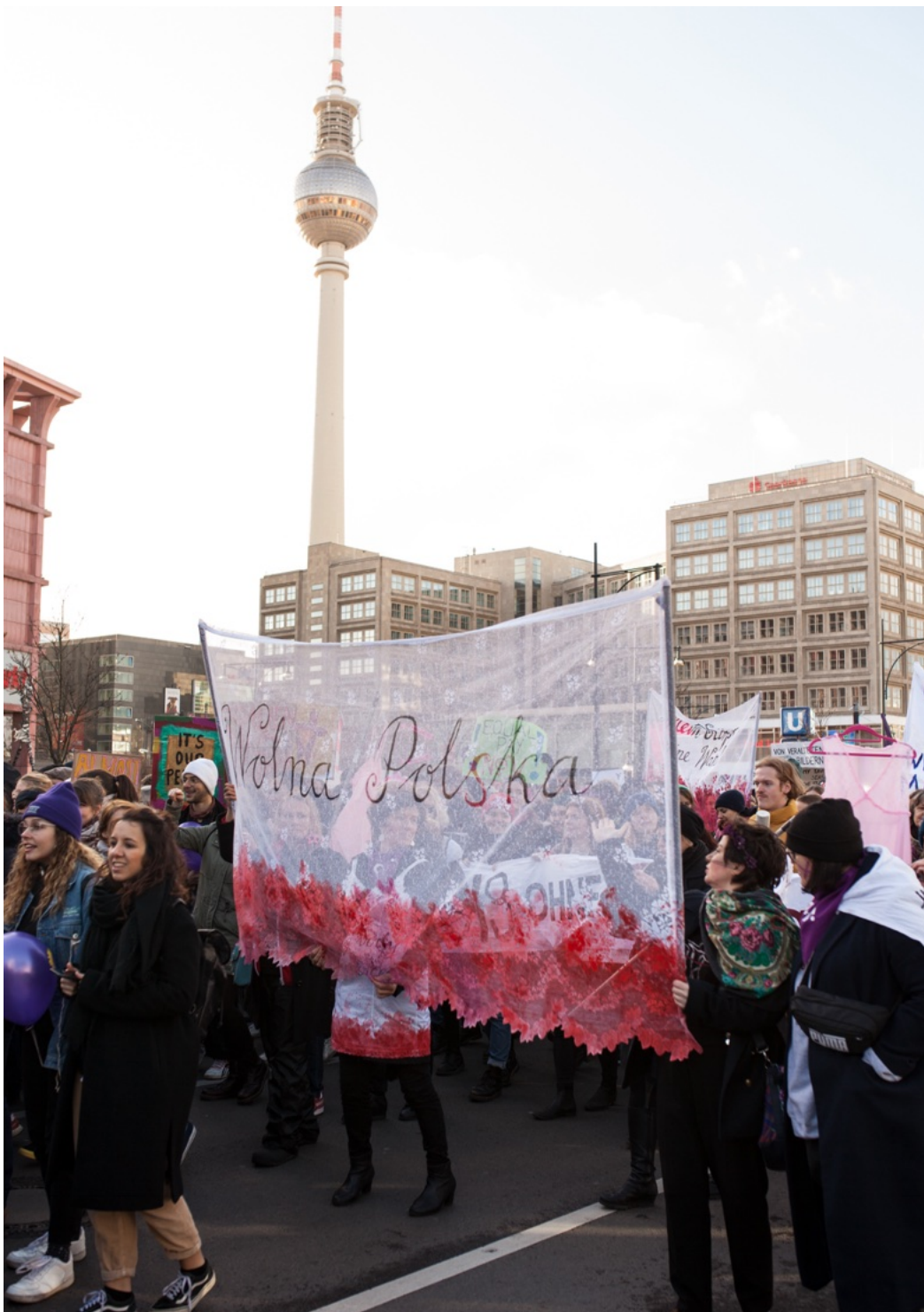
8.3.2019 | International Women's Day | Foto: CAMILLA LOBO