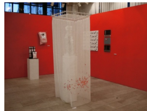
"Unbearable Beauty", Sweet in Art exhibition Galeria Sztuki, Legnica, 2009