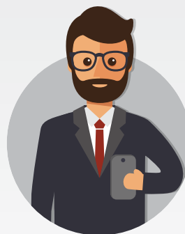
QA , QC MANGER