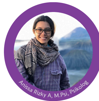
Educational and Personal Development Psychologist