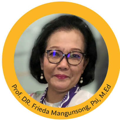
Family, Adult, and Special Needs Psychologist