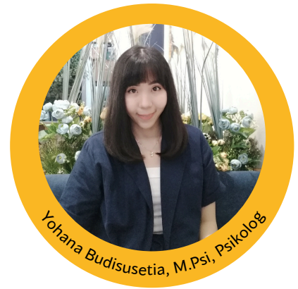
Educational and Child Development Psychologist