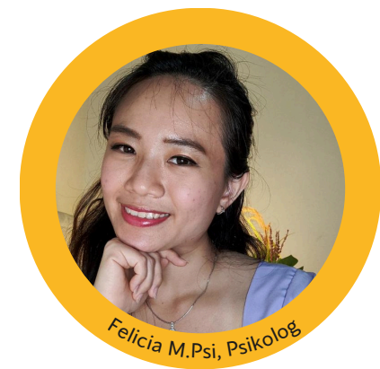
Educational Psychologist for Children and Adolescents