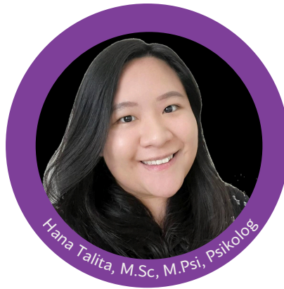
Educational and Career Counseling Psychologist