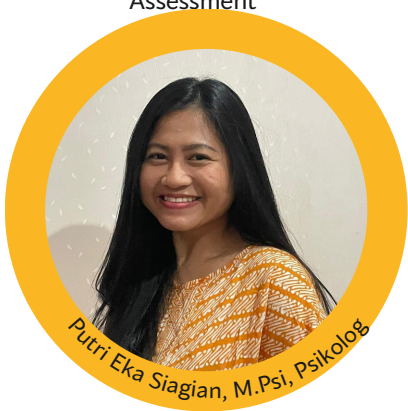
Educational, Special Needs, and Personal Development Psychologist