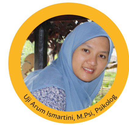
Educational, Career, and Special Needs Psychologist