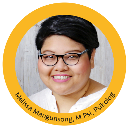
Clinical Psychologist for Children, Adolescents, and Talent & Interest Assessment