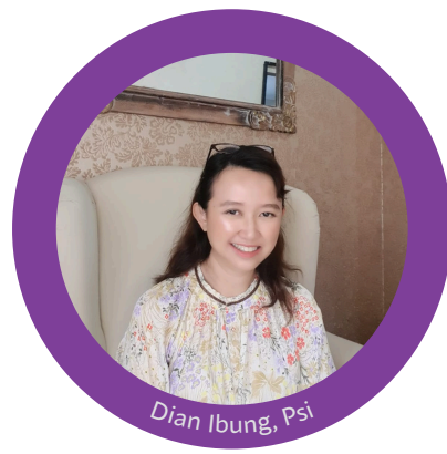
Family and Adult Clinical Psychologist