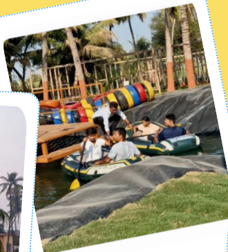
Boating in canal