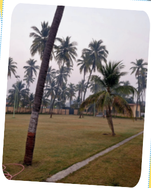
The Outdoor Play