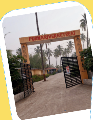
PRR Main Gate

SAFE JOYFUL SKILL BUILDING SCHOOL PICNIC