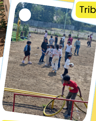
Hunt For Hut