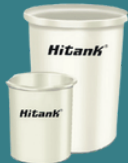
Chemical Storage Container