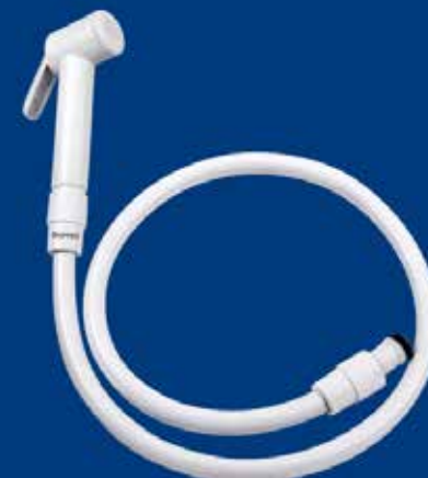
FLOWGUARD SUPREME WHITE WITH 1 Mtr. PIPE