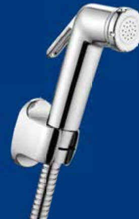
FLOWGUARD SUPREME CP WITH 1 Mtr. PIPE