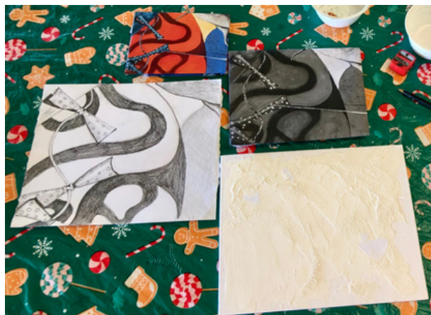
The various steps taken for learning about Textural Techniques

Every 1st and 3rd Thursday each month from approx.. 1 – 3.30pm