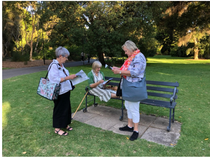
Now... Where on earth do we start?