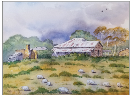
Above: "Farmhouse at World's End - Burra" Pen and Watercolour