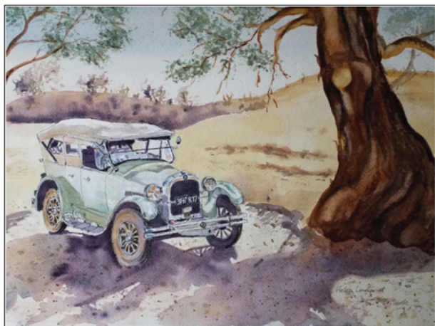
“1925 Dodge at Holowiliena Station” Pen and Watercolour