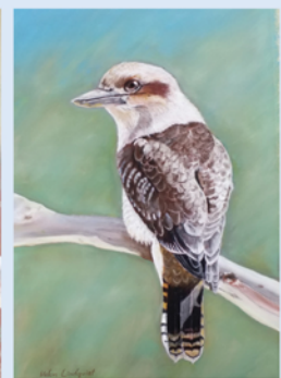
"Kookaburra" Showing various progression stages in Pastel (P.S. Hopefully you saw the final one at our Art Exhibition in May?)