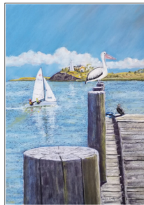
Below: "Sailing at Narrung" Pastel