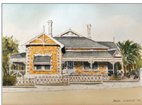
“Moonta House” Pen and Watercolour

I love watercolour and the amazing way it behaves particularly with “wet in wet”. If there is a need for detail, I will use pen first and then add watercolour as needed. I also love pastel and pastel pencil for its vibrancy of colour. It is so totally different to watercolour, but I love both. My ‘studio’ is a small bedroom so there is no more room to store any more mediums!