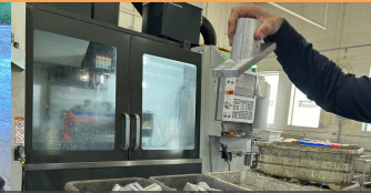
Hollaender Manufacturing Co.