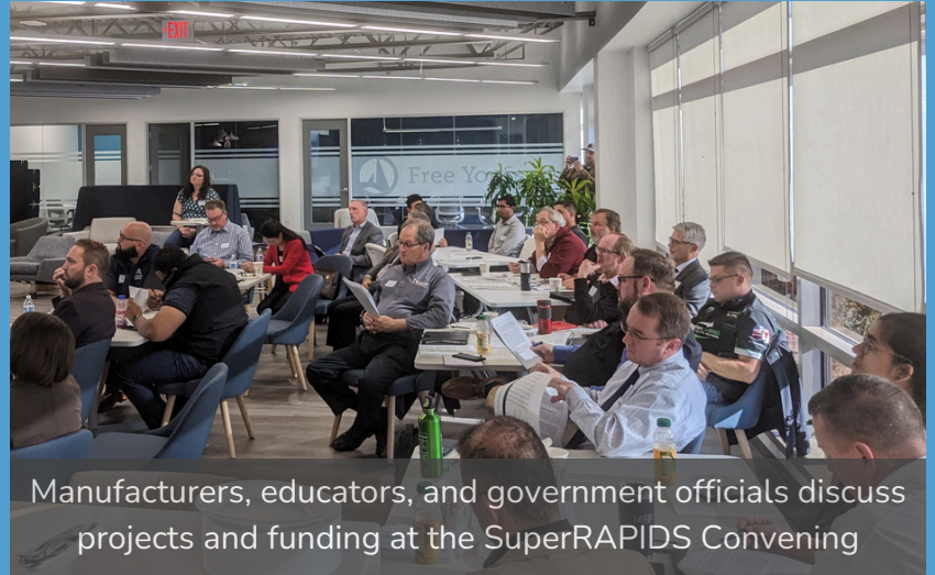
Manufacturers, educators, and government officials discuss projects and funding at the SuperRAPIDS Convening