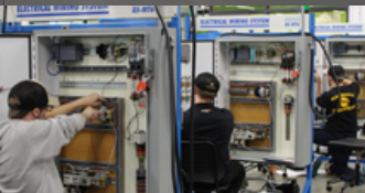
Gateway CC Covington