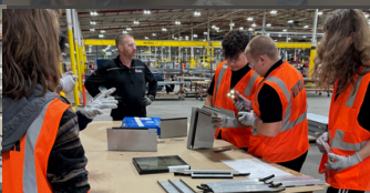
Pioneer Cladding & Glazing Systems, Inc