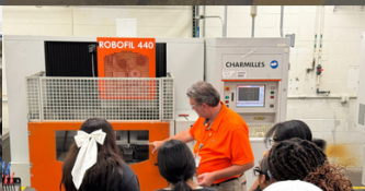
Deceuninck North America