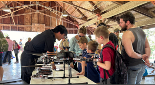
Sinclair CC Dayton

In October, AMIP Cincy and our partners reached an unprecedented 5,900 young people through manufacturing tours and awareness events. These photos represent only a fraction of these opportunities.