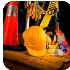
Fire & Industrial Safety

We offer certified safety solutions for industrial workplaces, ensuring worker protection.