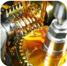
Industrial & Automotive Lubricants

We provide high-performance lubricants for smooth and efficient machinery operation.