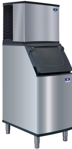
M420 Ice Machine on D420C Bin