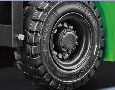
Standard rubber tread tires