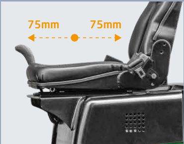
Seat can be adjusted backwards and forwards