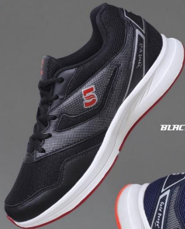
BLACK | MAROON