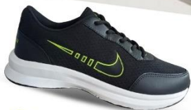
D GREY / F GREEN