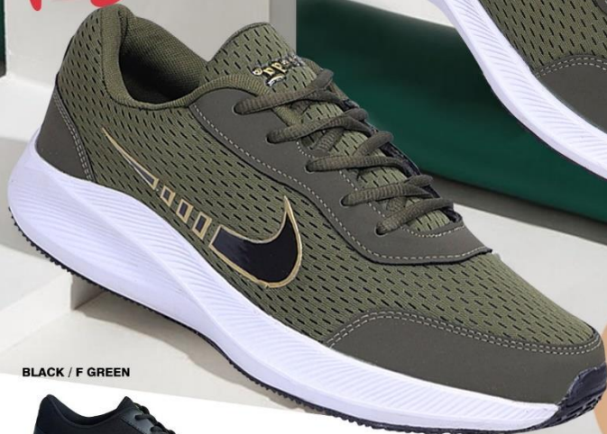
BLACK / F GREEN