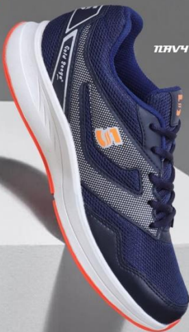
NAVY | ORANGE