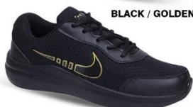
BLACK / GOLDEN