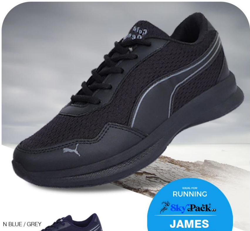
N BLUE / GREY