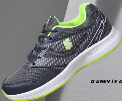
D GREY | F GREEN