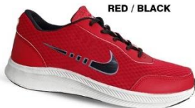
RED / BLACK