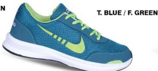
T. BLUE / F. GREEN