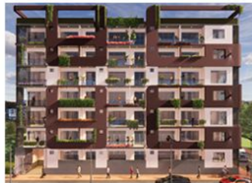
Vision Realty, Koramangala