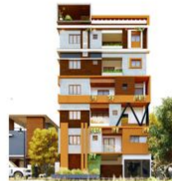
Dhanshree Enclave, Koramangala