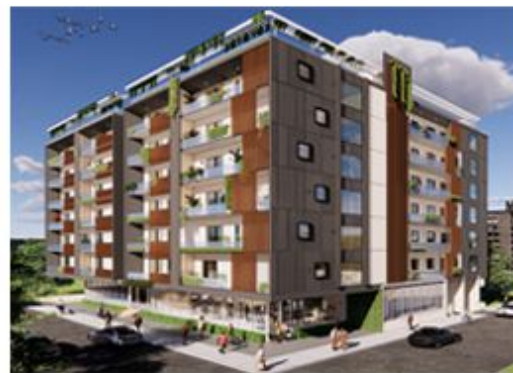
Sagar Enclave, Koramangala