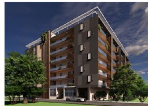
Sarovar Enclave, Koramangala