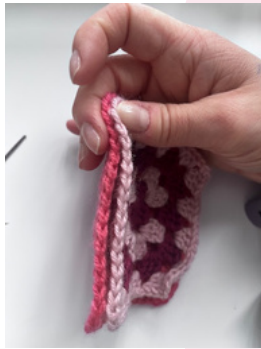
1) Hold motifs RS together

When all your motifs are finished and ready to join, hold two motifs with RS together. Take a tapestry needle and thread with yarn in colour that complements the colours on the final rounds of your motif. Work the tapestry needle under both loops of each stitch, working from middle to outer edge (see photos) all the way along the motif.