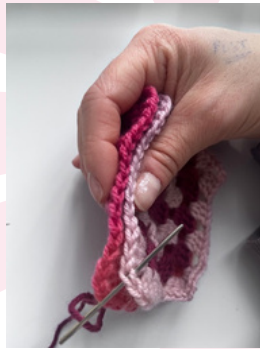
2) Insert tapestry needle under both loops of each st, working from middle to outer edge of motif