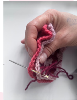
3) Insert needle under corresponding st on opposite motif (from middle to outer edge)