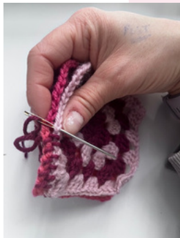
4) Repeat step 2 and 3 along motif