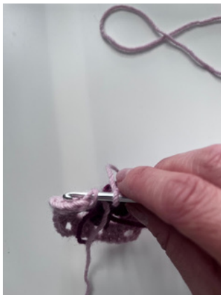
Tuck working yarn along crochet hook

On the final tr st of the round, yoh, insert hook into st, yoh and pull up loop (3 loops on hook). Yoh and pull through two loops. Tuck working yarn along hook and introduce new yarn colour by laying it over the hook. Pull new colour through final two loops on hook to complete the stitch in the new colour. Continue pattern in new yarn colour.