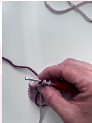
Introduce new yarn, holding yarn tail along crochet hook and yoh in new colour