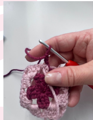
Work ch sts in new colour and continue in pattern.