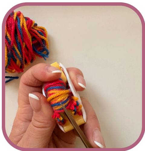
Fig. 3 - Cut along middle groove