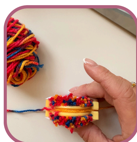
Fig. 4 - Cut a length of yarn and tie along middle groove