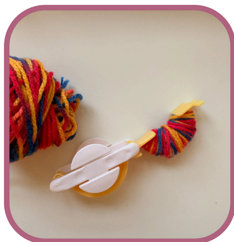
Fig. 2 - Cover entire section with yarn (& repeat for other side)