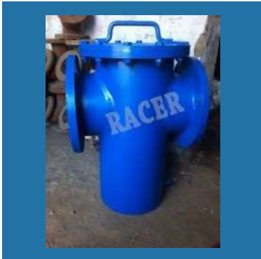
Stainless Steel Fabricated Basket Strainer