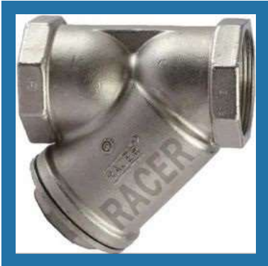
Screwed End Industrial Strainer