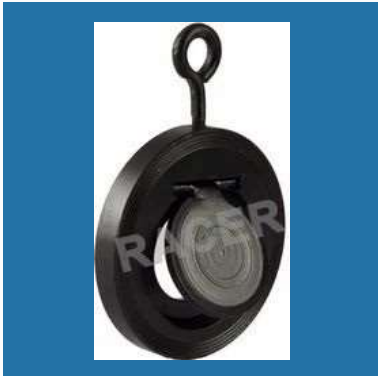
Sandwich Type Mild Steel Non Return Valve