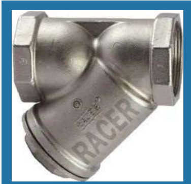
Screwed End Stainless Steel Y Type Strainer