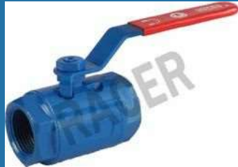
Screwed End MS Two Eye Type Ball Valve