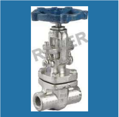
Socket Weld End FS Gate Valves