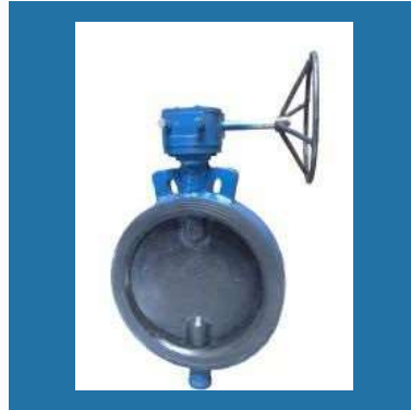
Gear Operated Butterfly Valve