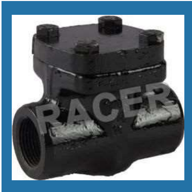
Socket Weld Forged Steel Check Valve