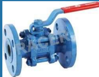
Flanged End Cast Steel Ball Valve