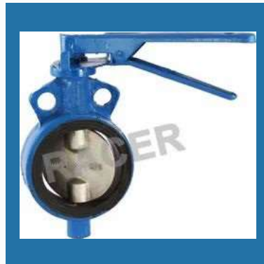
CS Wafer Type Butterfly Valves