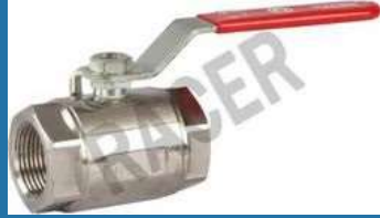
Screwed End SS Ball Valve