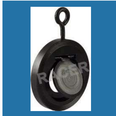
Wafer Type Mild Steel Check Valve