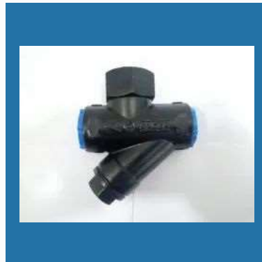
Thermodynamic Steam Trap