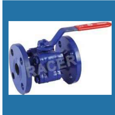
Flanged End Mild Steel Ball Valve