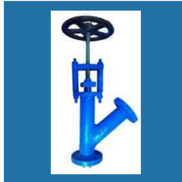
Flanged End Mild Steel Flush Bottom Valve