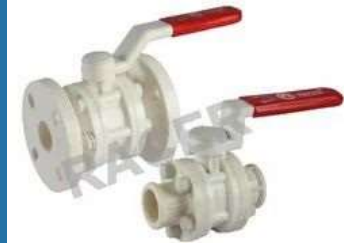
PP Ball Valve