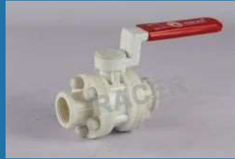
Screwed End PP Ball Valve