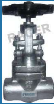
Socket Weld Stainless Steel Globe Valve