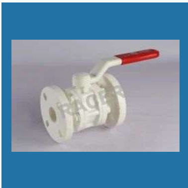
Flanged End Polypropylene Ball Valve