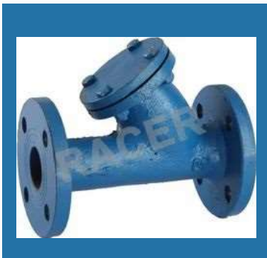
Flanged End Cast Iron Y Type Strainer