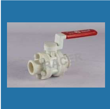
Socket Weld Polypropylene Ball Valve