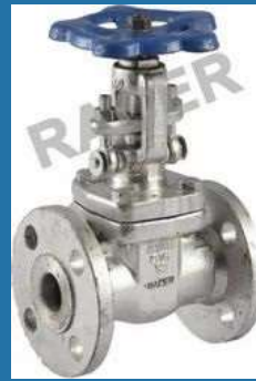
Flanged End Forge Steel Globe Valve