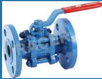
Flanged End CS Ball Valve