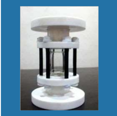
Flanged End PP Sight Glass