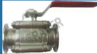
Triclover End SS Ball Valve