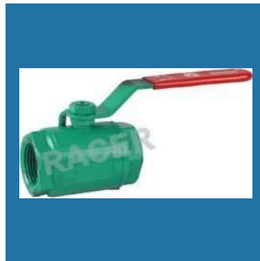
Socket Weld Mild Steel Ball Valve