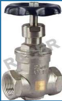
Socket Weld End Stainless Steel Gate Valve