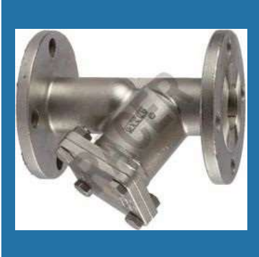
Flanged End SS Y Type Strainer