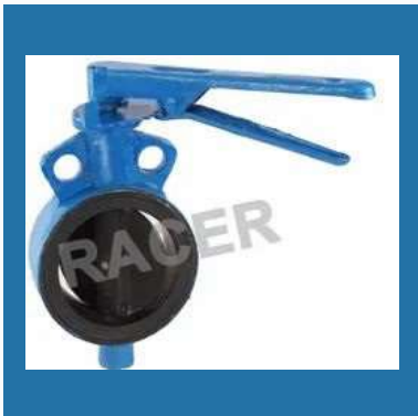
Wafer Type CI Butterfly Valves