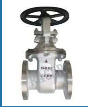
Flanged End Stainless Steel Gate Valve