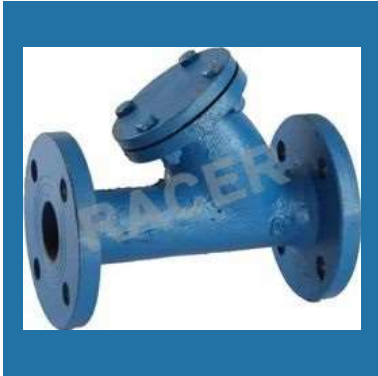
Cast Steel Y Type Strainer