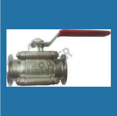
Triclover End Stainless Steel Ball Valve