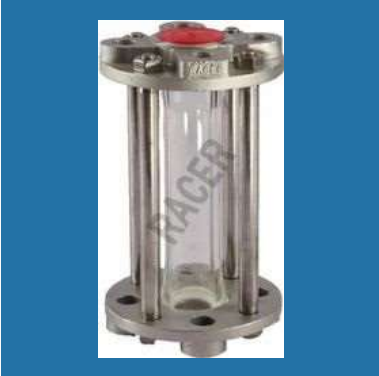
Flanged End SS Sight Glass