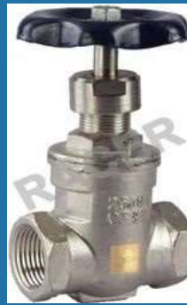
Screwed End Stainless Steel Gate Valve