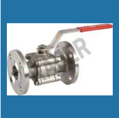
Flanged End Investment Casting Ball Valve