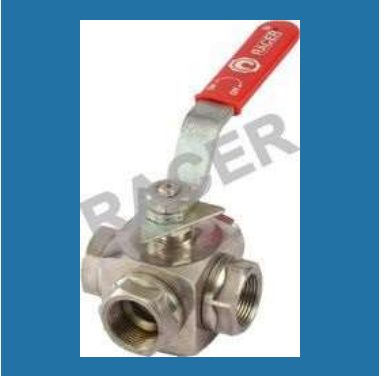
Screwed Ends SS 3 Way Ball Valves