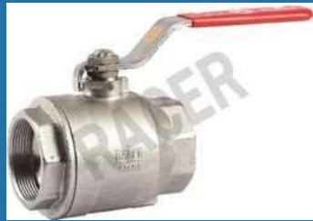
Screwed End Stainless Steel Ball Valve