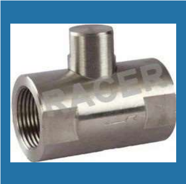
Socket Weld SS Check Valve