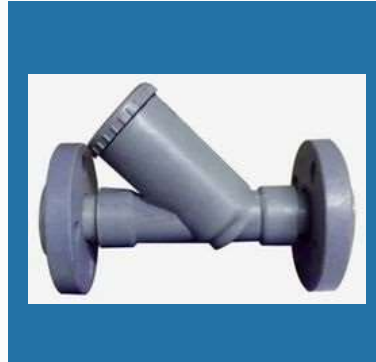
Flanged End PP Y Type Strainer