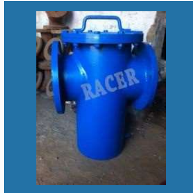
Flange End CI T Type Strainer