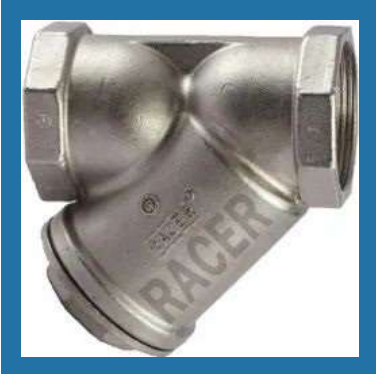
Screwed End SS Y Type Strainer