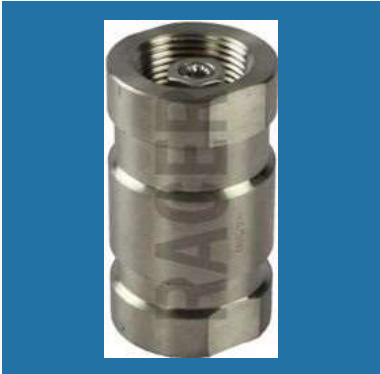
Screwed End SS Check Valve