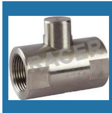
Horizontal Type Check Valve