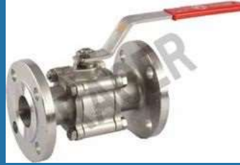
Flanged End SS Ball Valve