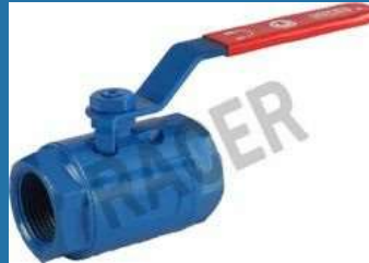
Screwed End Mild Steel Two Eye Type Ball Valve