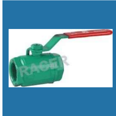
Screwed End MS Ball Valves