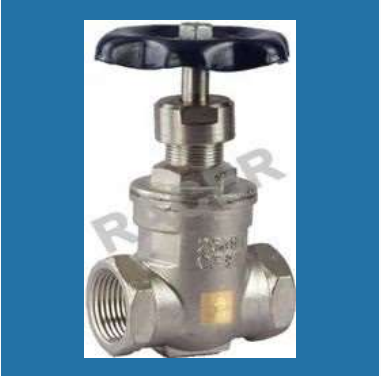
SS Gate Valve