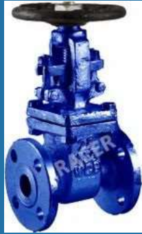
Flanged End Cast Iron Gate Valve