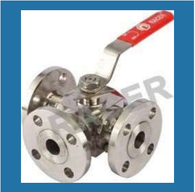
Flanged End 3 Way Ball Valves