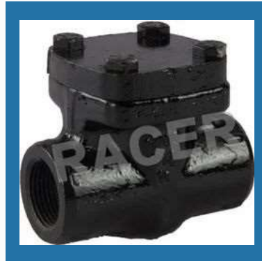
Screwed End FS Check Valves