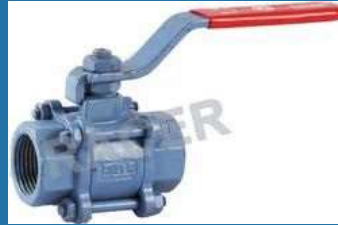
Screwed End Cast Steel Ball Valve