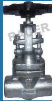
Screwed End Stainless Steel Globe Valve