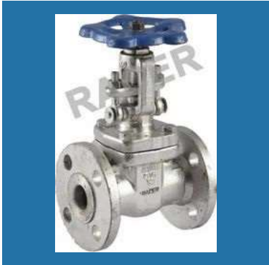
Flanged End FS Gate Valves