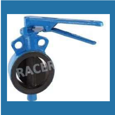
Wafer Butterfly Valve