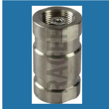
Screwed End Stainless Steel Non Return Valve