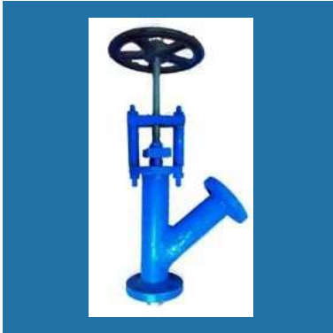
Flanged End SS Jacketed Flush Bottom Valves