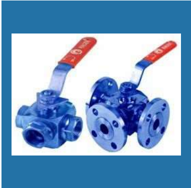
Screwed Ends MS 3 Way Ball Valves