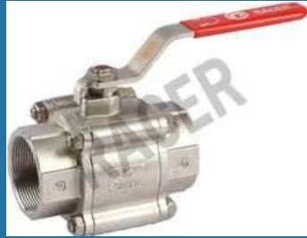
Socket Weld Stainless Steel Ball Valve