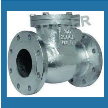
Flanged End Cast Iron Check Valve