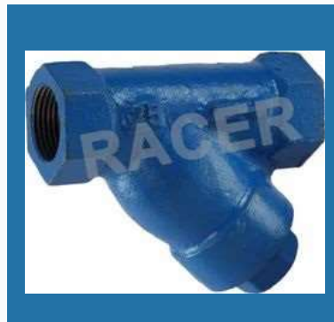
Screwed End Cast Iron Y Type Strainer