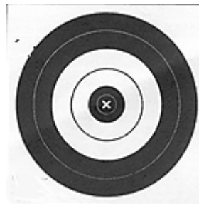
Figure 2. (Dakota Target)