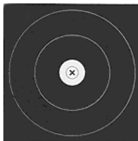
Figure 4. (Hunter Target)