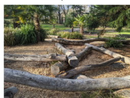
Log Jam Parkour