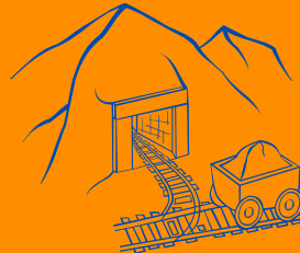
FERTILIZER & CEMENT PLANTS