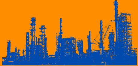
PETROLEUM & REFINERIES