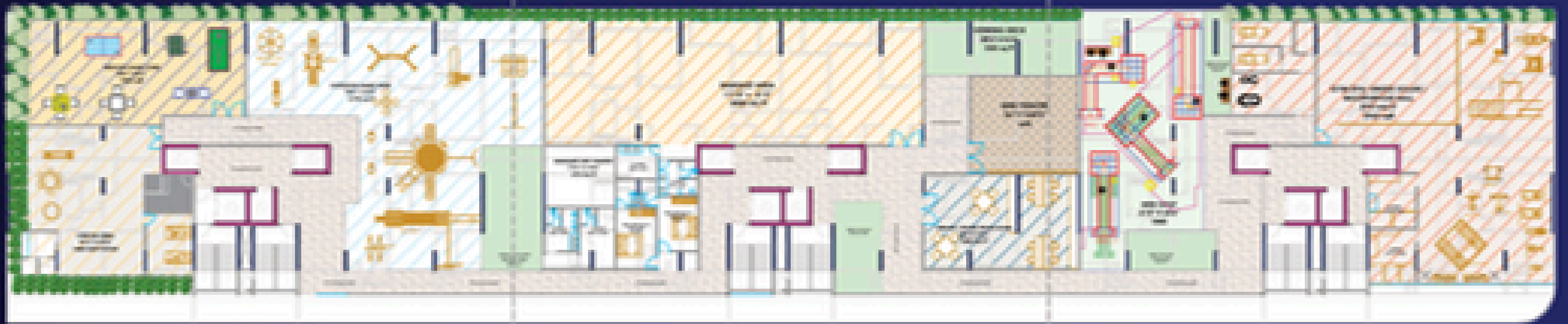
AMENITY FLOOR PLAN