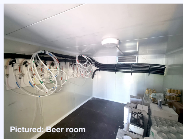
Pictured: Beer room

Furthermore, a well-executed installation promotes safety by ensuring that all parts comply with industry standards and regulations. This not only protects the equipment but also the people working in or around the cold room. In essence, investing in a good installation process is essential for achieving energy efficiency, operational reliability, and safety.