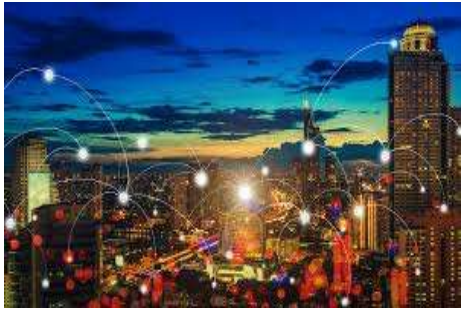
SAFE & SMART CITIES