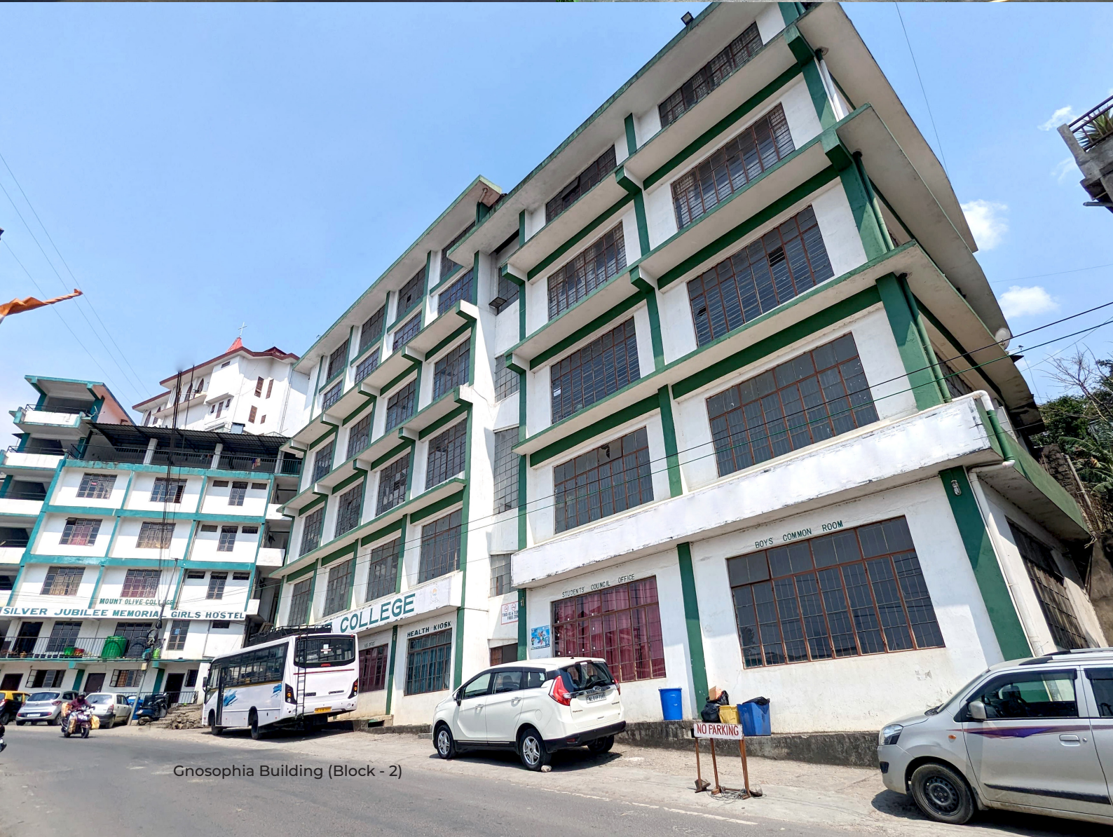
Gnosophia Building (Block - 2)