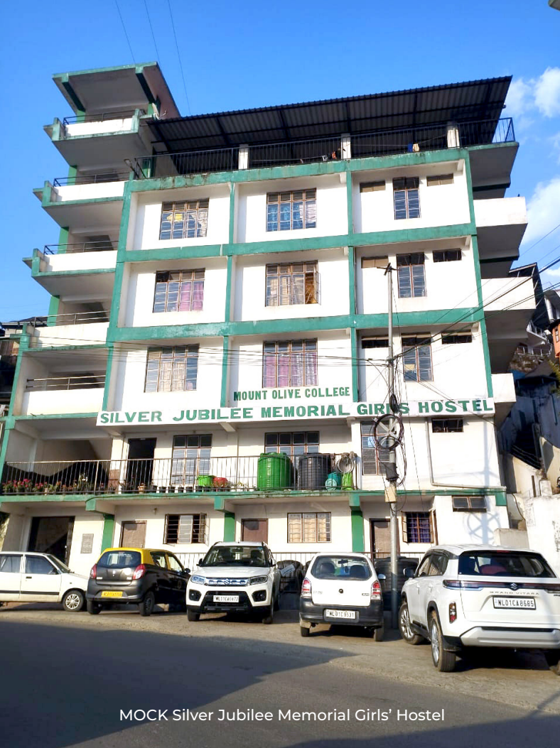
MOCK Silver Jubilee Memorial Girls' Hostel