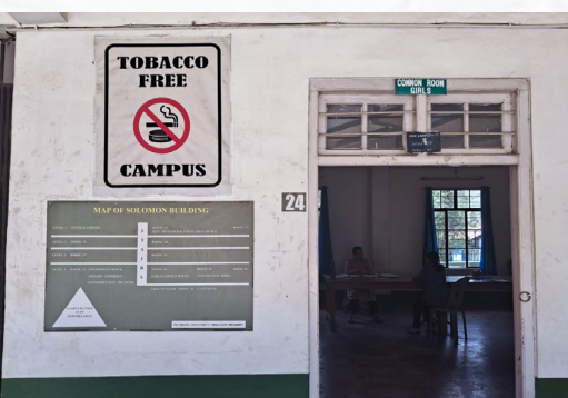
Girls Common Room