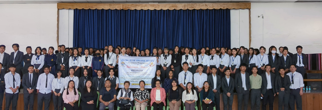
Seminar on Substance Abuse