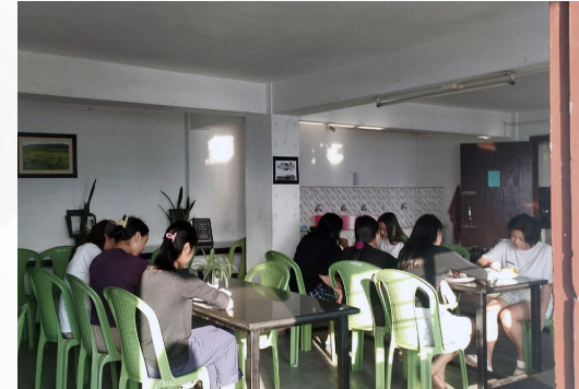
Girls Hostel (Dinning Hall)