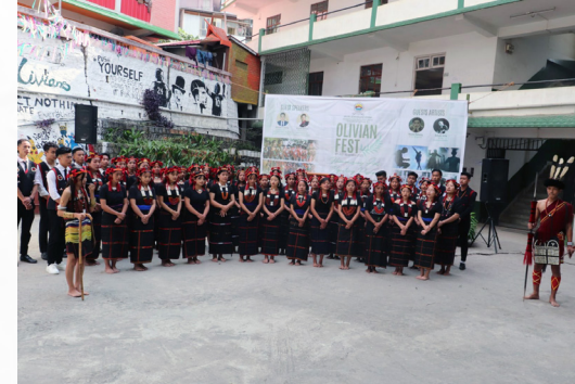
Olivian Fest Cultural Troupe