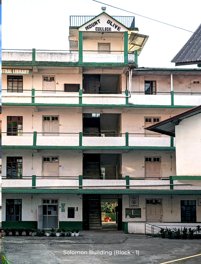
Solomon Building (Block - 1)