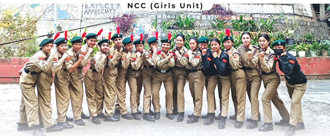
NCC (Girls Unit)