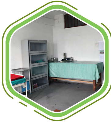
Health Kiosk under the Ministry of Health & Family Welfare, New Delhi, the Government of Nagaland to provide free primary health services to the college and the community under the RKSK.