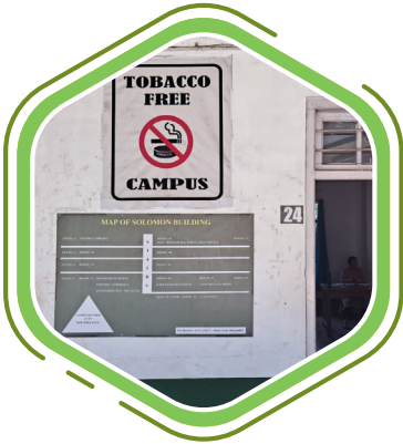
Tobacco-free campus since 2017 as declared by the Tobacco Control Cell, Kohima, through the District Administration.