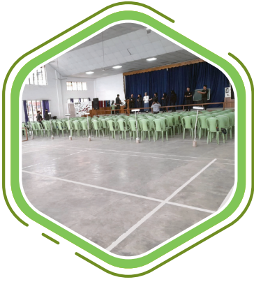
Auditorium- cum- Indoor Stadium for sports and cultural activities.