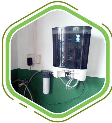
Availability of Safe drinking water through RO filters.