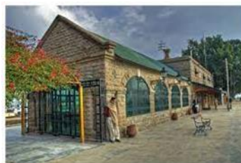
Golra Railway Station