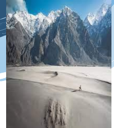
Sarfaranga Cold Desert