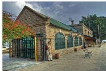
Golra Railway Station