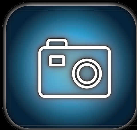
PHOTO-REALISTIC RENDERINGS & VIRTUAL VIDEOS

Our team can create Architectural and structural models using schematic design documents or fully completed construction documents at any point during the design and building process.