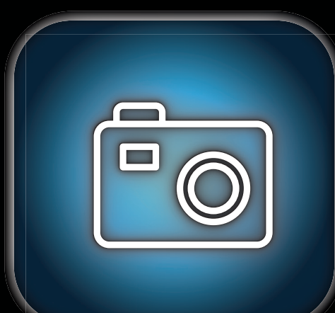
PHOTO-REALISTIC RENDERINGS & VIRTUAL VIDEOS

Architectural and structural modeling using pre-built models or ground up models created in house. Our team can create models using schematic design documents or fully completed construction documents at any point during the design and building process.