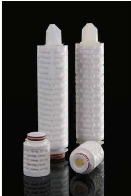
Note: TETPOR is a registered trademark of Parker domnick hunter