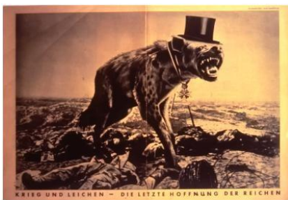
"War and Corpses - The Last Hope of the Rich"

We have done extensive research on the technical aspect of the Lahaina fires. We believe that the fire had to be planned because 8 different things had to lined up to happen at the same time which would not have happened in nature. Science will prove these events were planned murders. Please explore the Lahaina tab under GLOBALISTS on our website. We consider the people who are being burned to a crisp in their own beds or as they run away are TARGETS too. They may be the only ones that are worse off than Targets who are radiated, tortured and then killed. They die a horrifying death in fear and agony as the flames consume them. Burning to death is one of the most painful ways to die. Don't forget about these Targets as you find ways to deal with your targeting. They are Targets in another immediately deadlier way.