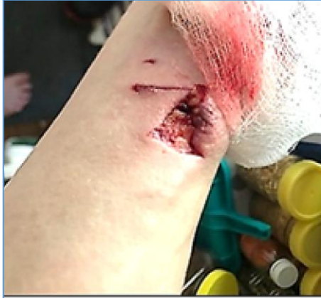
Targeted woman's forearm was operated on while she was put to sleep wound left open!

surprising how many people are willing to be Nazis and torture people, stalk them, take over their homes and rape men and women. People will do anything for money. You see why this activity is called “GANGstalking,” because so many are involved in each event. It’s not the “normal” stalking of one person following and harassing another person. It is a criminal organization under the guise of lawful proceedings taking away civil rights of people placed in the ULTRA secret government torture/kill plan.